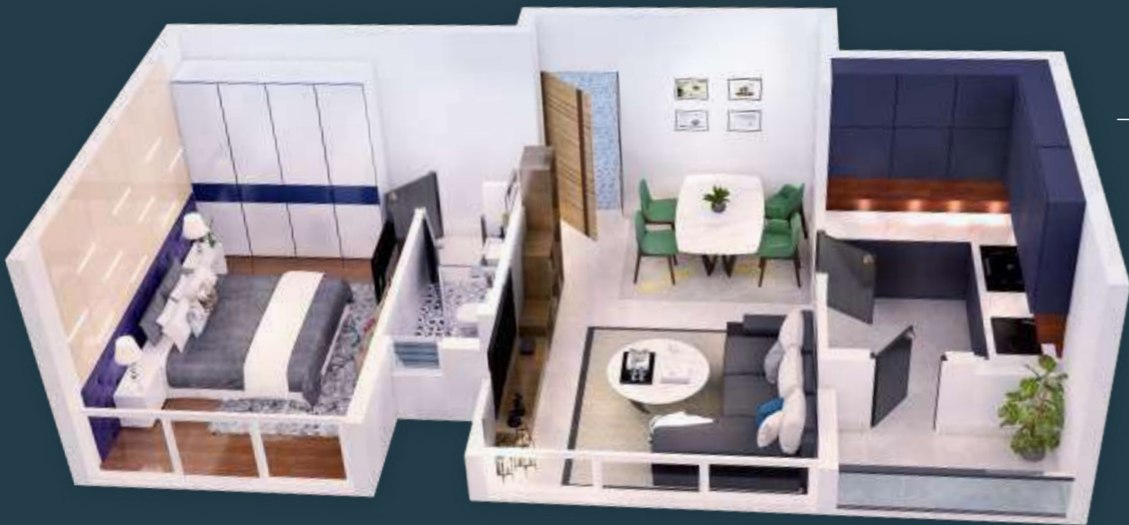
Typical 1 BHK