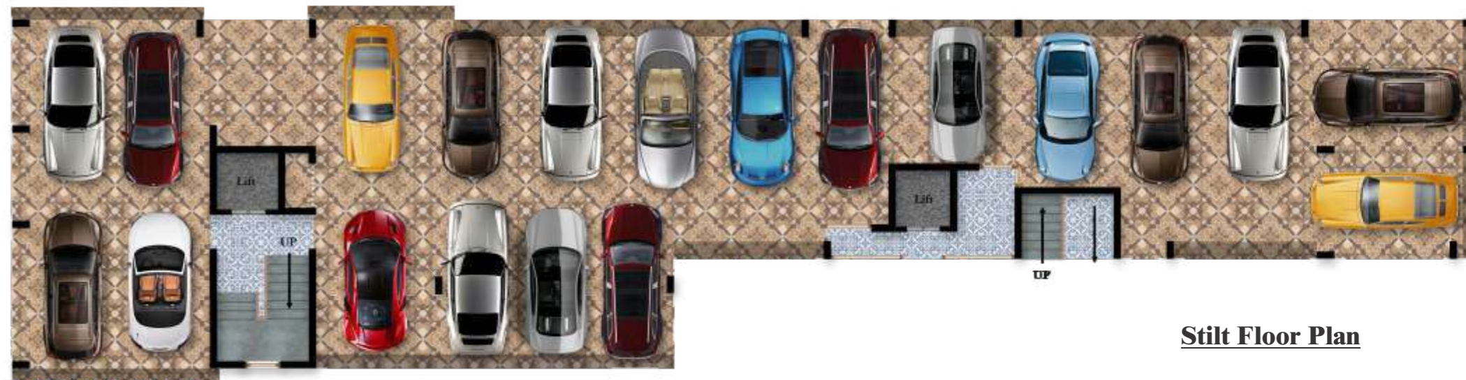
Stilt Floor Plan