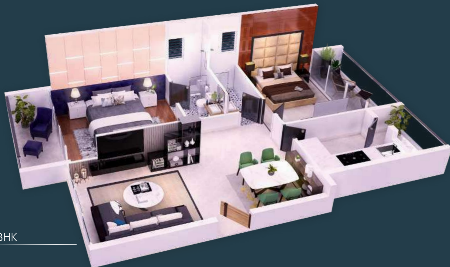
Typical 2 BHK